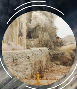
Explosions (mines, tunnels)