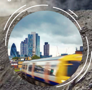
Impact of transport (road, rail)